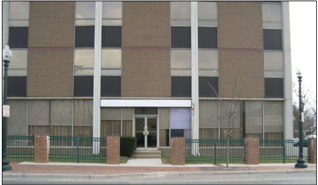
EagleBank Entrance From Fenton Street